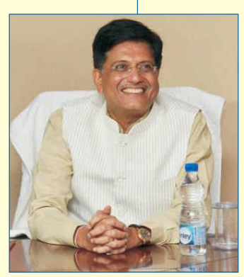
Piyush Goyal takes charge 2