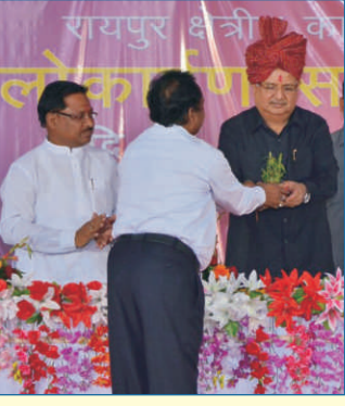
IBM Raipur office commissioned