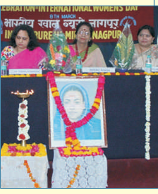
Women's Day celebrated